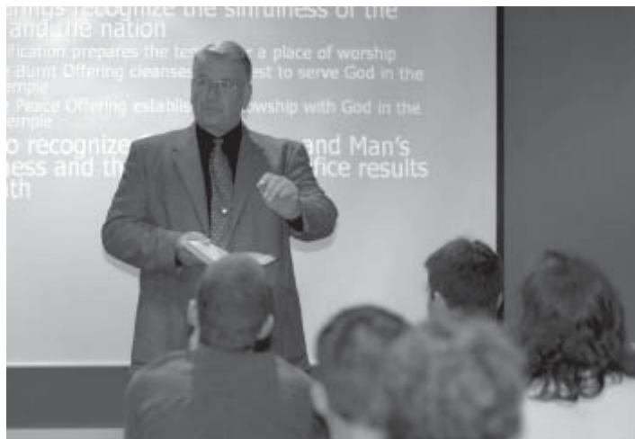
The Bible department endeavors to enlighten students through a deep understanding of the Christian faith.

Study of the principles of correct and fallacious reasoning involved in traditional logic and modern logic.