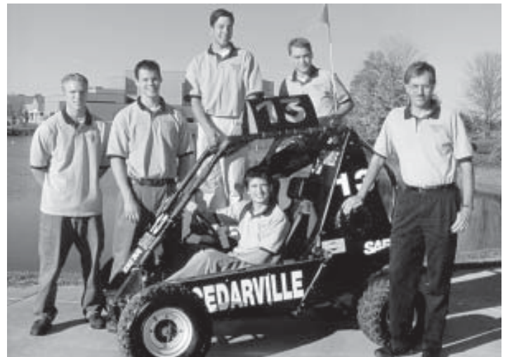
Competition against other schools provides opportunities for engineering students to demonstrate their skills by designing and building a vehicle.

Selected topics in mechanical engineering at the 4000-level that expand the depth of existing 3000- and 4000-level courses or expose the students to advanced concepts not taught in other courses. Topics may be proposed by the engineering faculty or students. Prerequisite: instructor's permission.