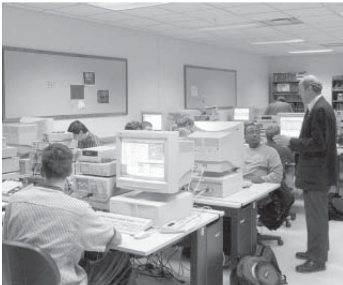
Engineering laboratories provide advanced technical equipment enabling students to practice their skills.

Design and development of electronic products to meet specific requirements using the top-down design method. Introduction to serial communication design, design for reliability, product cost and safety, environmental issues, project management, electronic design tools, prototype methods, noise analysis in data conversion, and circuit-board layout. Student teams prepare a project proposal, design and prototype electronic subsystems using analog and digital integrated circuits and microcontrollers, use computerized design tools, and conduct design reviews. Three lecture hours and one two-hour lab per week. Prerequisites: EGEE-3220 Electronics II; EGCP-2110 Microprocessors; EGEE-3110 Linear Systems; senior status in electrical engineering. (Fee: $100)