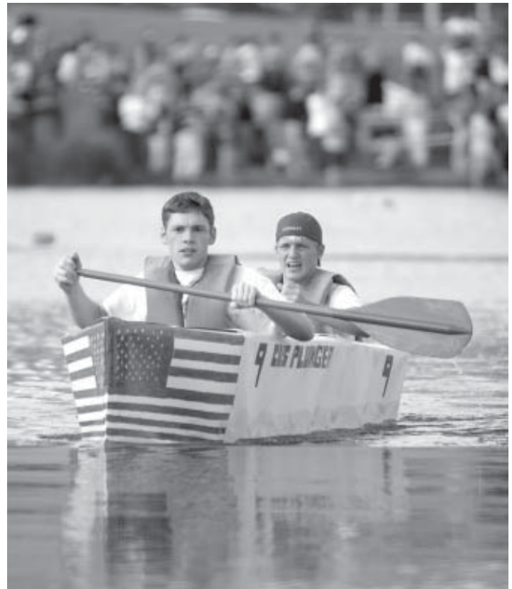
First-year engineering students apply their design skills making cardboard canoes and racing them across Cedar Lake during Homecoming Weekend.

Introduction to the fundamentals of power circuits and the principles of analysis and characteristics of transformers and AC and DC rotating machines. Two lecture hours and one two-hour laboratory per week. Prerequisite: EGEE-2010 Circuits; or EGEE-2050 Circuits and Instrumentation. (Fee: $100)