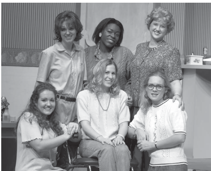
Steel Magnolias , performed in the Stevens Student Center Theatre, was a humorous, tender and inspiring celebration of friendship.

Each semester the Communication Arts Department presents a major theatrical production. In recent years the department has produced The Pirates of Penzance , As You Like It , The Glass Menagerie , and Lost in Yonkers . Performances are often sold out and always greatly appreciated by the university family as well as many community guests.