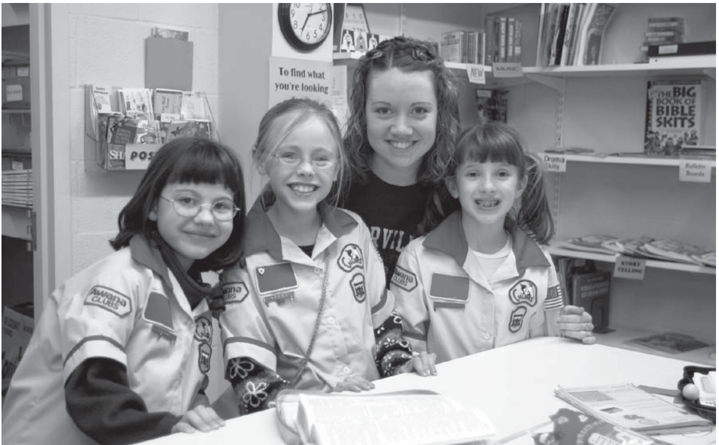
Christian ministry is a vital part of a Cedarville education and offers the opportunity for spiritual growth and development.

Involvement in campus organizations provides additional opportunities for learning and social interaction. A complete list of student organizations can be found at www.cedarville.edu/dept/cao .