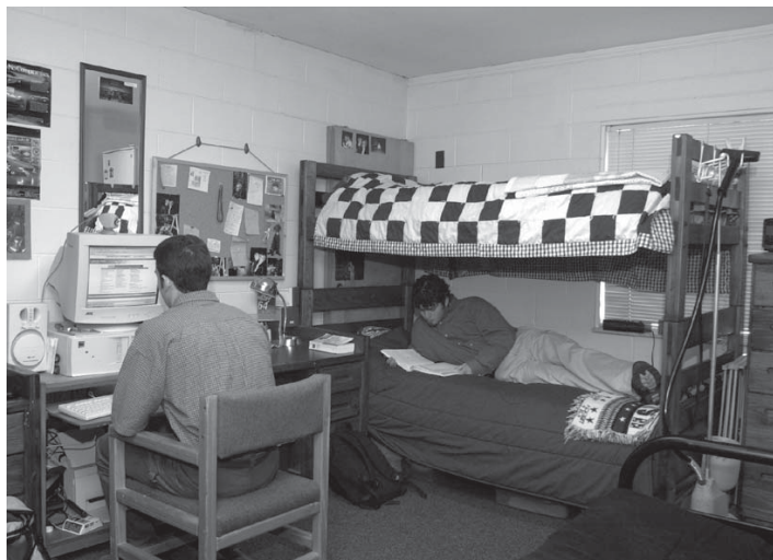
Each residence hall room is fully furnished and equipped with a computer, printer and phone.

At the start of each semester, new students are provided with opportunities designed to facilitate adjustments to their new surroundings. The program includes orientation for parents. Special interest sessions, question and answer times, small group meetings, and social activities provide opportunities to adjust to a new environment. Placement testing may be required during orientation.