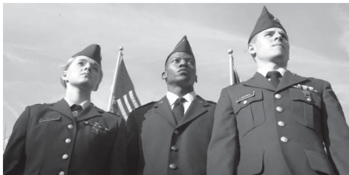
ROTC offers an excellent opportunity to learn leadership skills while also serving our country.

This lab provides an opportunity for students to apply Air Force procedures, techniques, and knowledge. Students will learn the Air Force organizational structure as well as customs and courtesies. GMC cadets will also develop their followership and teamwork skills in a cadet-led, cadre-supervised lab environment. Taken concurrently with 1000-level AES courses. Credit/no credit.