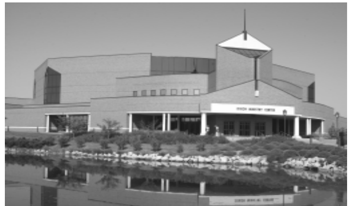
The Dixon Ministry Center—the heart of the campus.

Providing classrooms and offices, Williams Hall serves as the home of the academic departments of Education, Language and Literature, and Psychology.