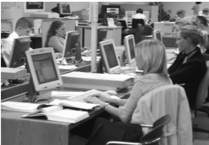
Computer labs can be found in every major academic building on campus.

Wireless network access is provided in most classroom areas, co-ed lounges, and in large gathering areas such as the Centennial Library, the Stevens Student Center, and the Dixon Ministry Center. Students are also allowed to provide their own wireless access in the residence hall rooms.