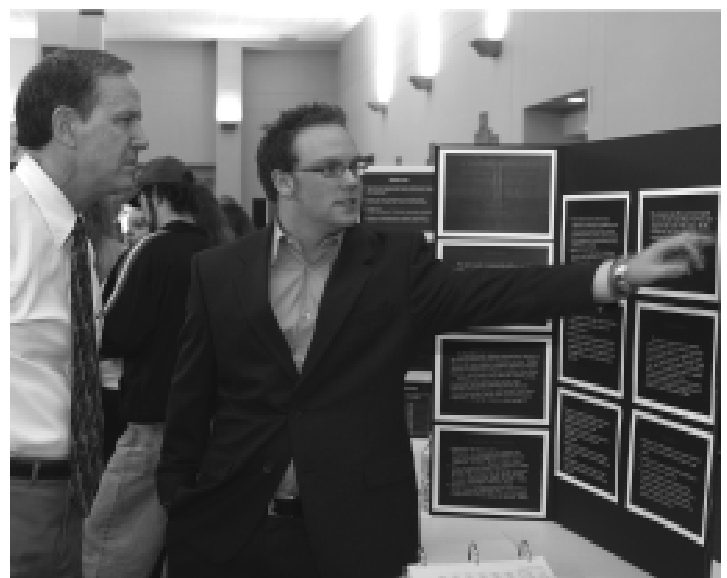
Psychology majors are challenged to conduct independent research and produce publishable works with the guidance of faculty advisors.