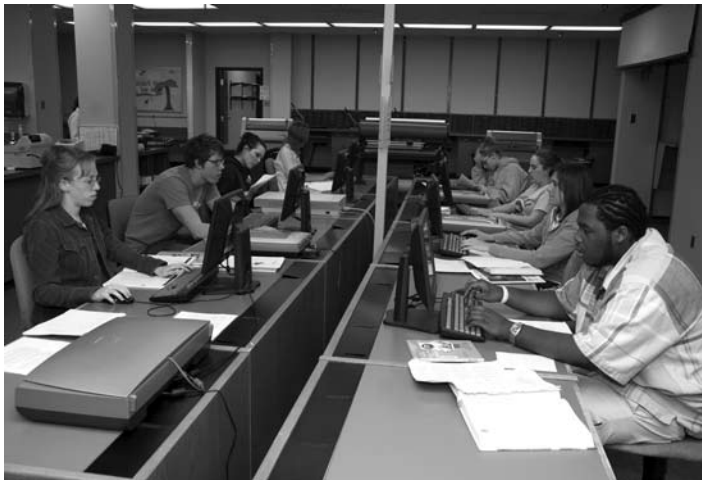
Not only can computer labs be found in every major academic building on campus, but all campus buildings are also equipped with wireless access.