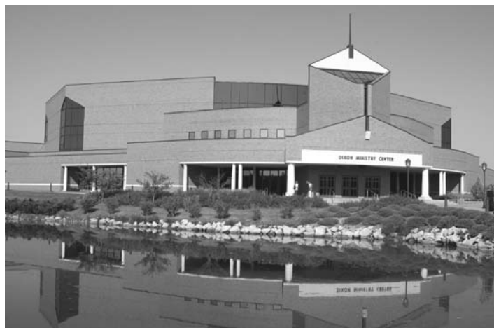
The Dixon Ministry Center – the heart of the campus.

Providing classrooms and offices, Williams Hall serves as the home of the academic departments of education, language and literature, and psychology.