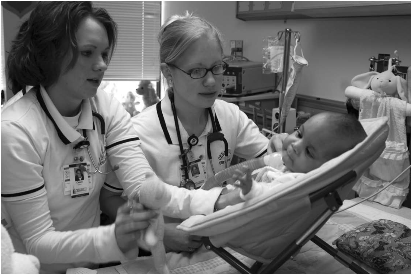
Because nursing students view their work as a ministry, they are able to impact many lives with the love of Christ.

Students focus on theoretical models of primary health care and health promotion. Contemporary health issues are examined in light of social policy initiatives and their impact on community building and disease prevention. Students use epidemiological and community resources to analyze and apply strategies for implementing community focused nursing practice. Prerequisite: NSG-2010 Member of Nursing Profession II, NSG-2020 Provider of Nursing Care II, NSG-3110 Pharmacology (corequisite). (Fee: $100)