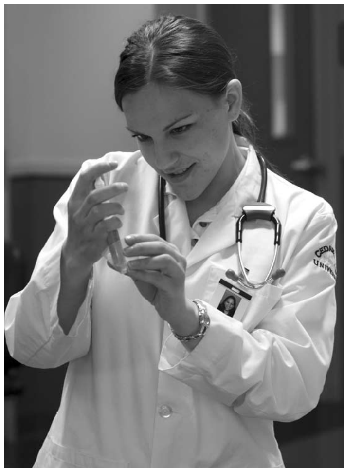
The caring nature of nursing is characterized by a sensitive, compassionate approach that recognizes and respects the uniqueness and worth of individuals.

Independent learning to secure an extensive background in a specialized area of nursing. May be repeated once. Prerequisite: signed contract between student and instructor in which work to be completed is described.