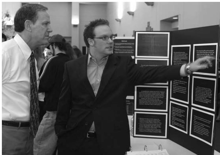
Psychology majors are challenged to conduct independent research and produce publishable works with the guidance of faculty advisors.

Concepts and theories of learning and cognition with emphasis placed on personal applications of accepted procedures. Prerequisite: PYCH-1600 General Psychology.