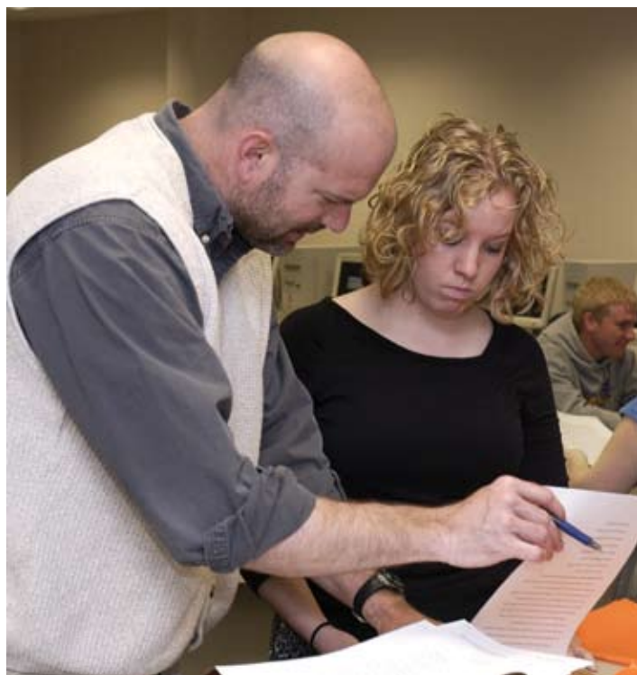
Students and faculty work together to generate creative and innovative ideas.