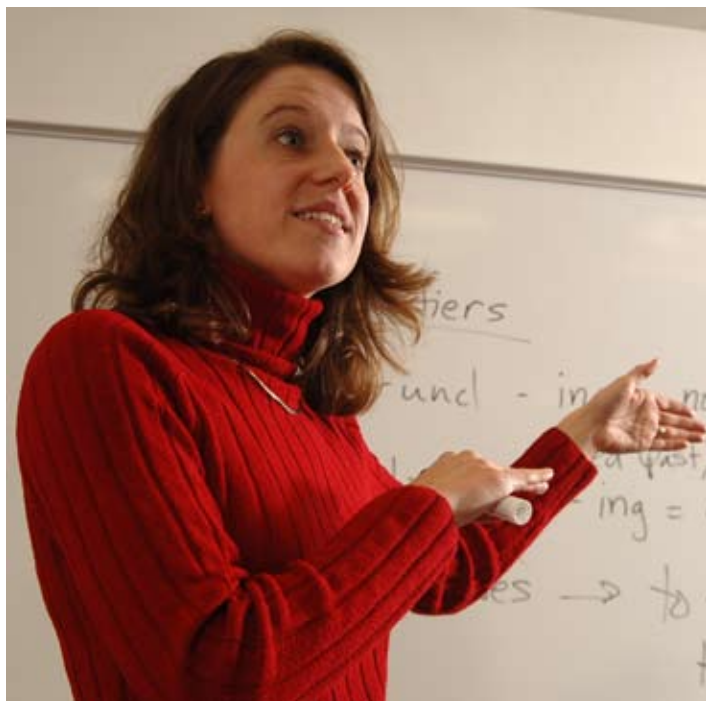
The English department faculty prepare students to think broadly and to evaluate literature and life from a Christian perspective.

Course provides an opportunity to do high-level work in creative nonfiction. Workshop environment will be rigorous and diagnostic, but also supportive. Prerequisite: ENG-3050 Creative Writing: Nonfiction. (even years)