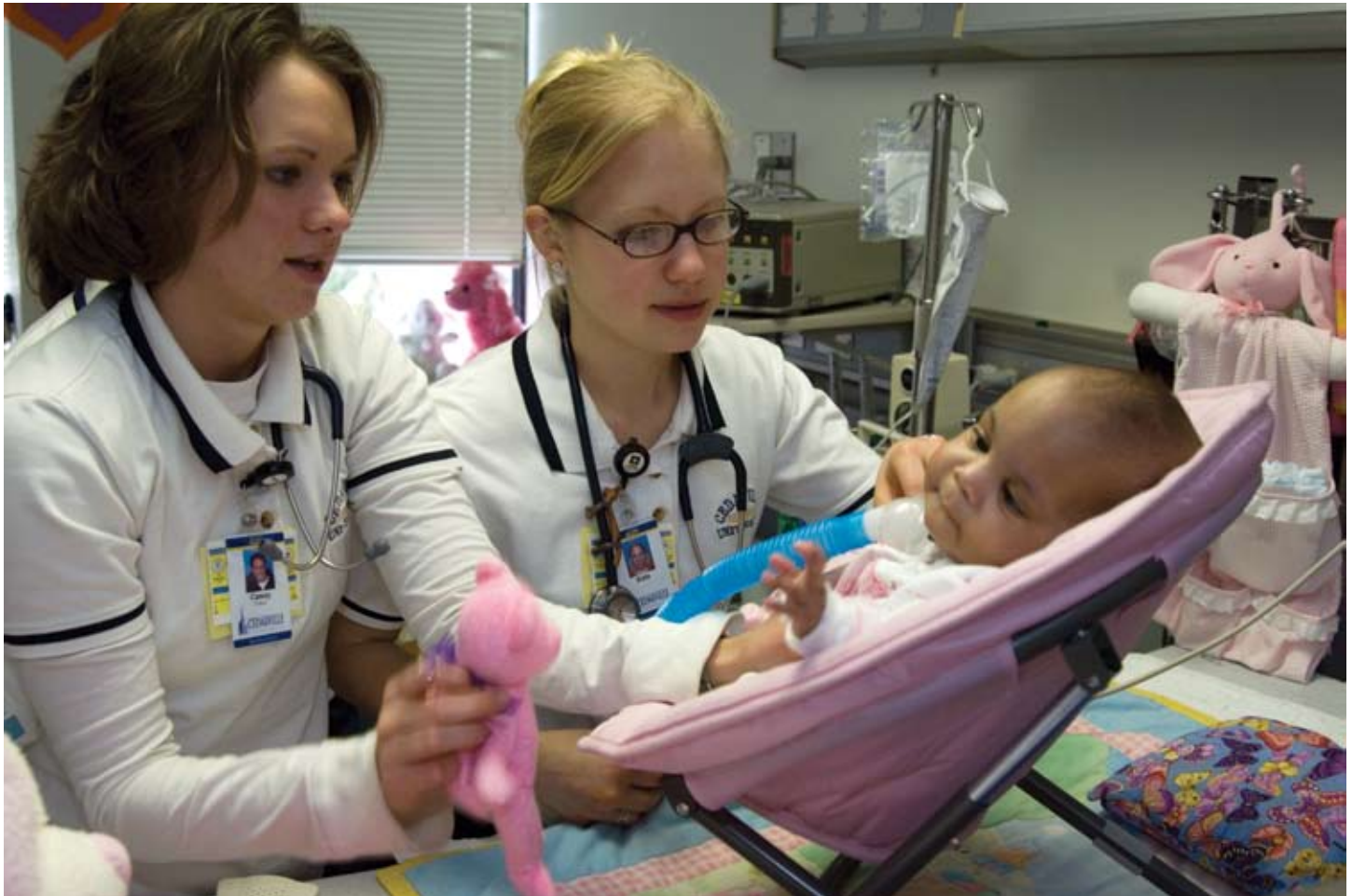
Because nursing students view their work as a ministry, they are able to impact many lives with the love of Christ.

Students focus on theoretical models of primary health care and health promotion. Contemporary health issues are examined in light of social policy initiatives and their impact on community building and disease prevention. Students use epidemiological and community resources to analyze and apply strategies for implementing community focused nursing practice. Prerequisite: NSG-2010 Member of Nursing Profession II, NSG-2020 Provider of Nursing Care II, NSG-3070 Nursing Care of Diverse Populations; NSG-3110 Pharmacology (corequisite). (Fee: $100)